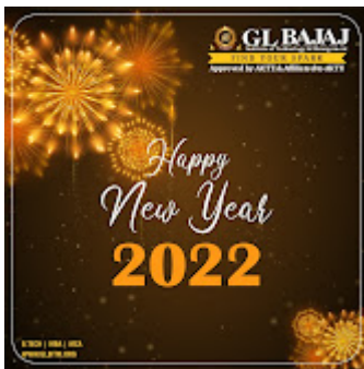
New Year 2022.jpg 296K

G L Bajaj Institute of Technology & Management Plot No-2, Knowledge Park-III Greater Noida, UP-201306 +91-9654947007 www.glbitm.org